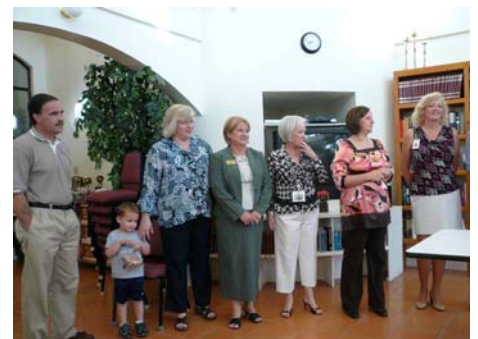
Pictures of our May Breakfast at Amethyst Arbor. The HSP West Board transition of Officers.