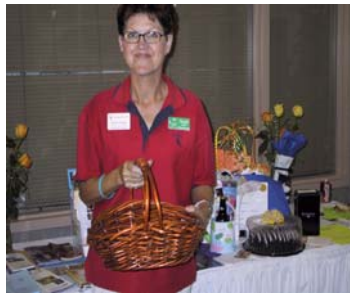
membership check in.