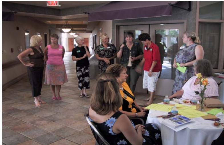
Your HSP Leadership at work.

Have you visited the HSP Web site? Go to www.hspwest.com .