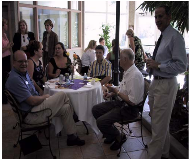
Members getting connected.

(Remember, we will include information on job openings and events you are having in this space. send the information to your newsletter editor or your president.)