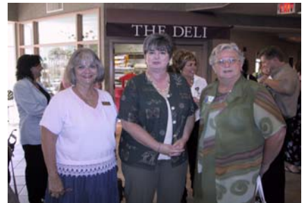
ready to network