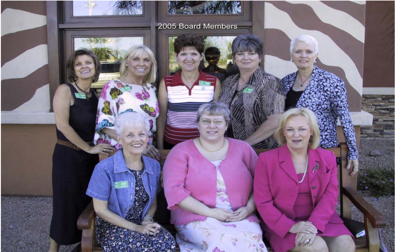
The 2005 HSP West Board Members